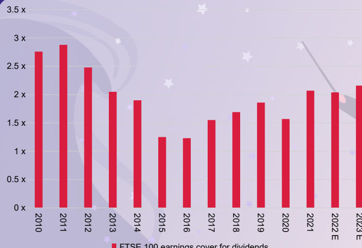
Source: Company accounts, Marketscreener, analysts' consensus forecasts

Companies may be choosing to let earnings growth outpace dividend growth so they can reinvest in their businesses, bolster balance sheets and rebuild cover, so that their shareholder distributions are not quite the hostage to fortune that they proved to be in 2020, should another unexpected shock emerge from left field.